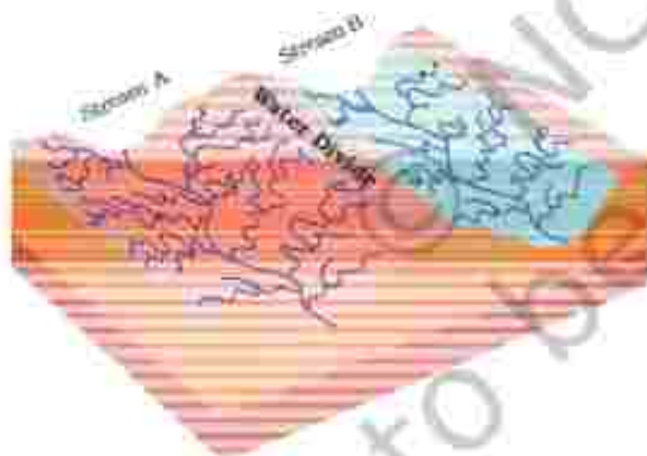
Figure 3.1: Water Divide

The term drainage describes the river system of an area. Look at the physical map. You will notice that small streams flowing from different directions come together to form the main river, which ultimately drains into a large water body such as a lake or a sea or an ocean. The area drained by a single river system is called a drainage basin . A closer observation on a map will indicate that any elevated area, such as a mountain or an upland, separates two drainage basins. Such an upland is known as a water divide (Figure 3.1).