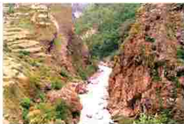
Figure 3.2: A Gorge

Apart from originating from the two major physiographic regions of India, the Himalayan and the Peninsular rivers are different from each other in many ways. Most of the Himalayan rivers are perennial . It means that they have water throughout the year. These rivers receive water from rain as well as from melted snow from the lofty mountains. The two major Himalayan rivers, the Indus and the Brahmaputra originate from the north of the mountain ranges. They have cut through the mountains making gorges. The Himalayan rivers have long courses from their source to the sea.