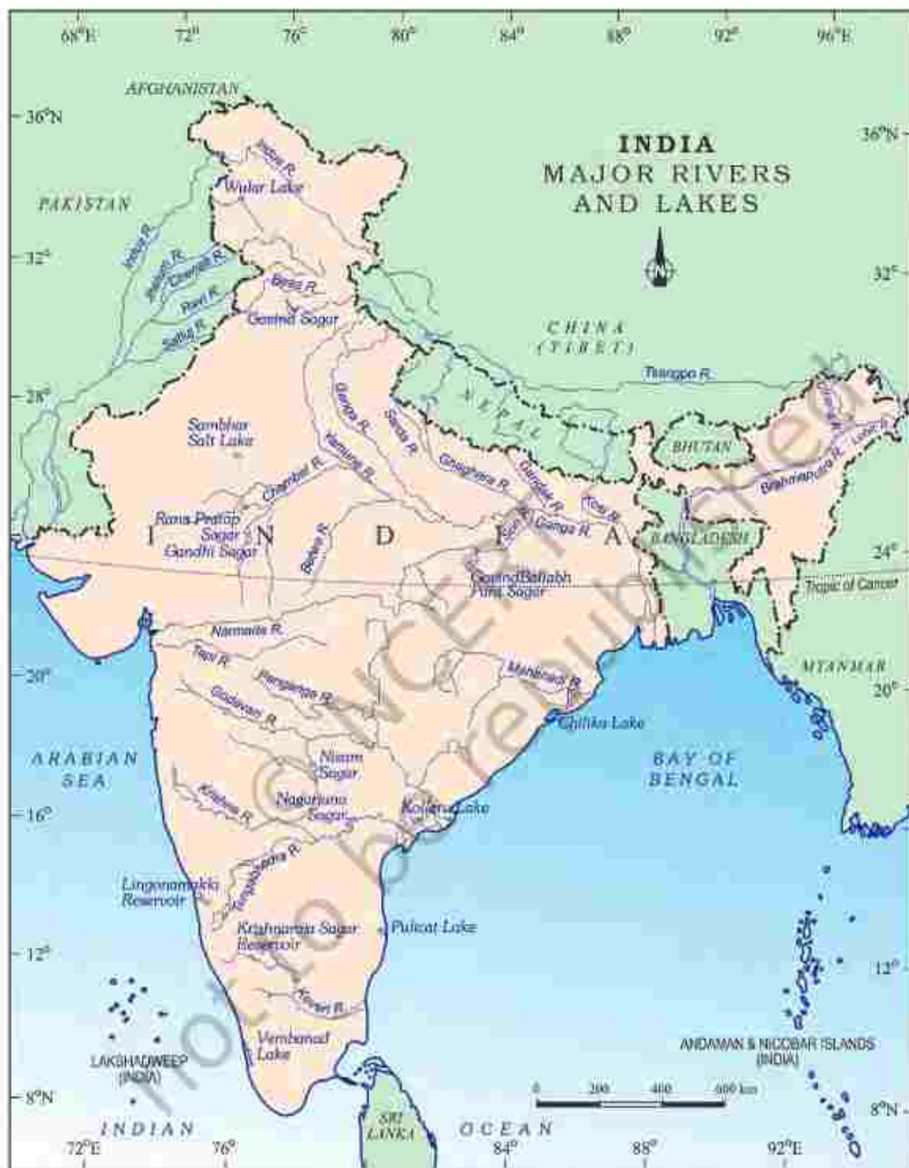
Figure 3.1 : Major Rivers and Lakes