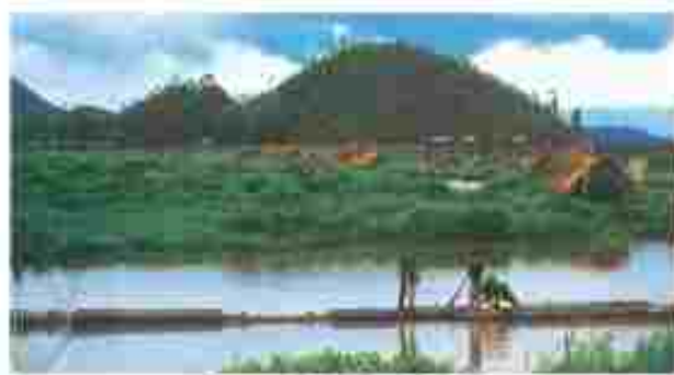
Figure 3.6: Loktak Lake

Most of the freshwater lakes are in the Himalayan region. They are of glacial origin. In other words, they formed when glaciers dug out a basin, which was later filled with snowmelt. The Wular lake in Jammu and Kashmir, in contrast, is the result of tectonic activity. It is the largest freshwater lake in India. The Dal lake, Bhimtal, Nainital, Loktak and Barapani are some other important freshwater lakes.