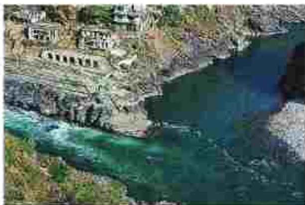
Figure 3.5: Confluence of Bhagirathi and Alaknanda at Devprayag

The Ganga is joined by many tributaries from the Himalayas, a few of them being major rivers, such as the Yamuna, the Ghaghara, the Gandak and the Kosi. The river Yamuna rises from the Yamunotri Glacier in the Himalayas. It flows parallel to the Ganga and as a right bank tributary meets the Ganga at Allahabad. The Ghaghara, the Gandak and the Kosi rise in the Nepal Himalaya. They are the rivers, which flood parts of the northern plains every year, causing widespread damage to life and property, whereas, they enrich the soil for agricultural use.